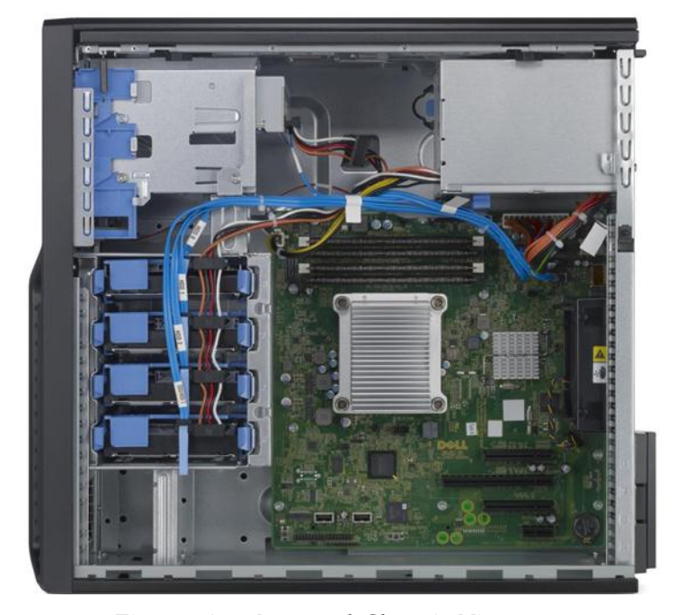
Figure 4. Internal-Chassis View

Figure 4 shows the internal-chassis view of the PowerEdge T110 II.